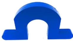
No-Tack Pad Example